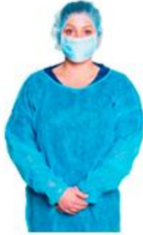
Isolation Gowns, Levels 1-3