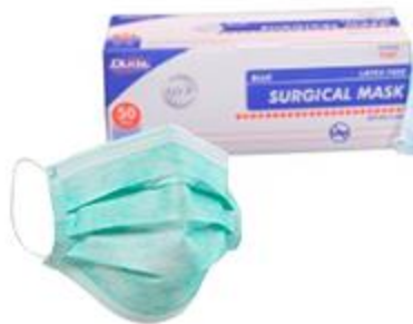
3-PLY Disposable Face Mask